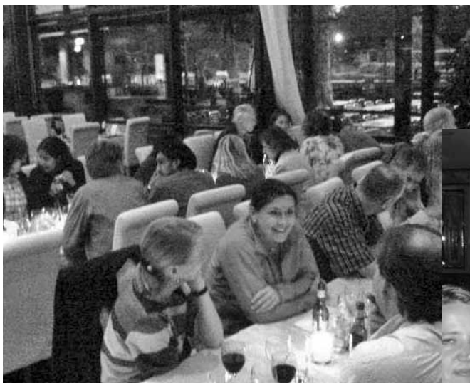
In the Restaurang Trädgåår'n

Of course, it wasn't all business – photographs of the dinner at the Restaurang Trädgåår'n, another in the Restaurant Lipp, and of a relaxed afternoon in the Café Husaren after our last session are evident of that.