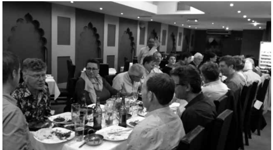
It's all over now! Letting our hair down in the Taj.

scholarship. There were rather too many highlights to mention. However, it is possible to get sense of the topics covered and the overall buzz generated by searching the Twitter hashtag #norbertelias2014.