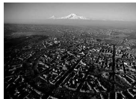
Yerevan, with Mount Ararat in the distance

International Institute of Sociology (IIS) 39th World Congress of Sociology Yerevan, Armenia 11–14 June, 2009