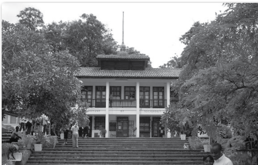
University of Ghana