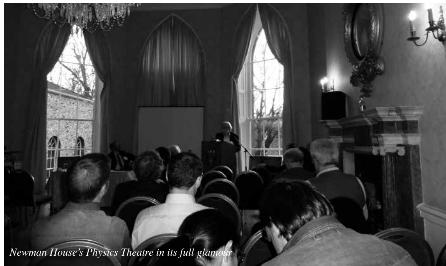
Newman House's Physics Theatre in its full glamour

Newman House, St Stephen's Green, Dublin, 7–8 January 2016